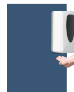
Dispensador de gel AUTOMATICO - PARED V3